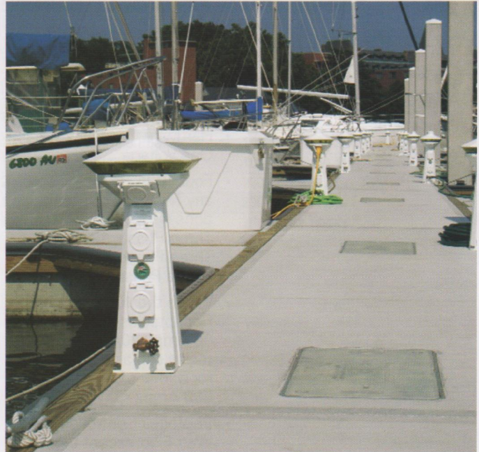
Above: Hatteras Light Power Pedestals

The Hatteras Light is an elegant and low cost alternative to the Lighthouse. It utilizes the same 360 degree light assembly as the Lighthouse, yet is only 30 inches tall. Thousands of these attractive pedestals are found not only in marinas, but also around pools, deck areas, boardwalks and landscape areas. The housing will never rust or corrode and comes with a limited lifetime warranty. This unit is popular for smaller slips at marinas with the Lighthouse and for private docks.